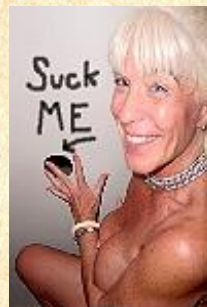
Glory Hole Girlz